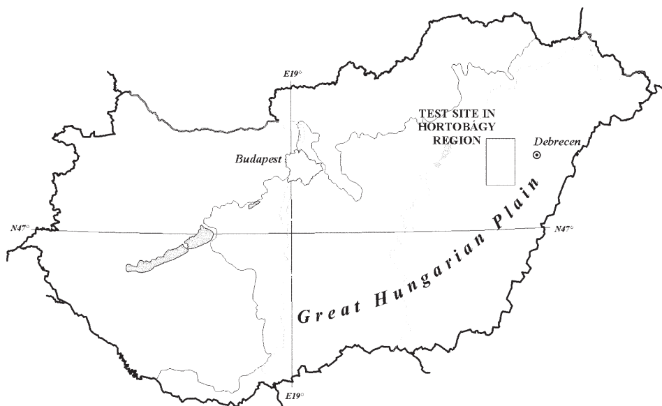
Fig. 1. Map of Hungary with the Great Hungarian Plain and the test site inside the Hortobagy region.